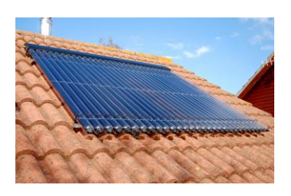
Solar thermal for hot water

<u>calculators/solar-energy-calculator</u>